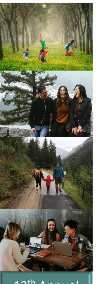
13<sup>th</sup> Annual Research Conference 2021