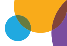
Figure 1.1: Bronfenbrenner's Ecological Perspective on Child Development